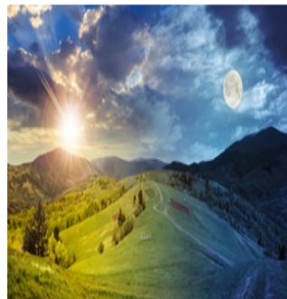
night and day