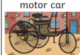
early Benz motor car