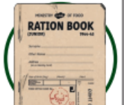
A ration book

Supply ships were targeted by German bombers and it was necessary to conserve as much food as possible.